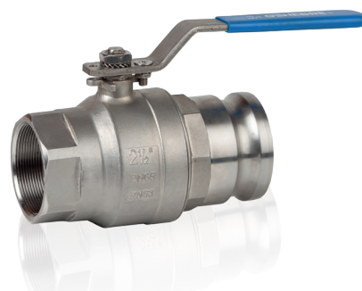
Versione Camlock / Camlock type