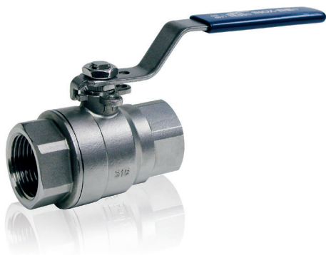
Versione standard / Standard type

Valvole a sfera 2 pezzi a passaggio totale / 2 pieces full bore ball valves